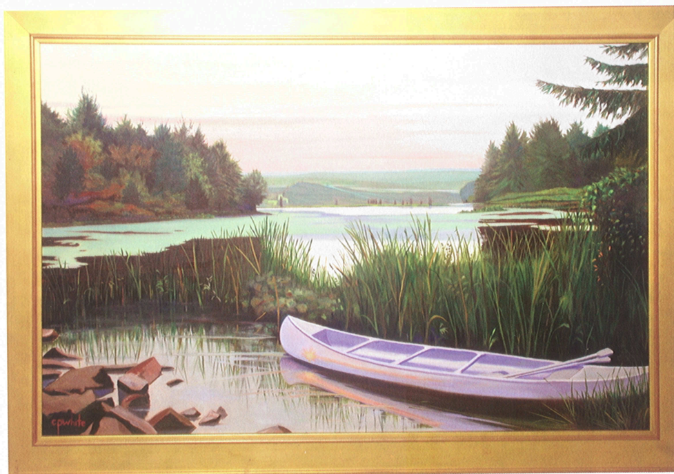
Chet White, Evening Passage