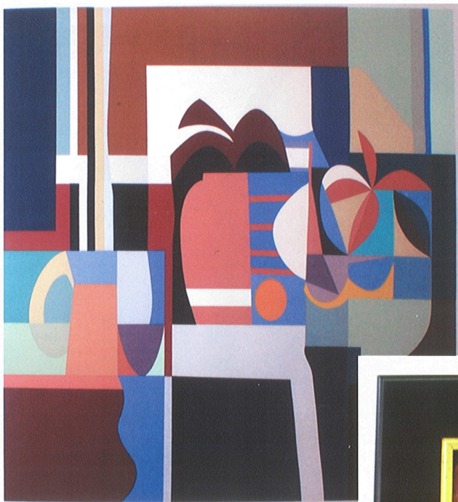
Janice Sorokin, untitled

Her curved mural, Forces of Life , suggesting the sea, sun, and sky, is a life-affirming addition to the waiting area; an attempt to capture the sense of "women in motion influencing the lives around them".