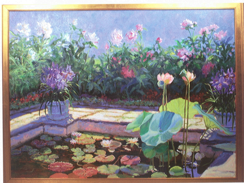
Peake-Virgina, Lily Garden